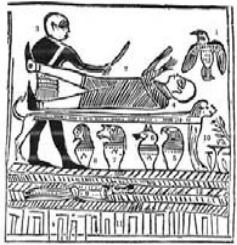
The facsimile from the Pearl of Great Price, Book of Abraham,

The contents of the Book of Breathing are certainly foreign to the teachings concerning Abraham found in the Bible. The Bible says he rejected paganism, whereas the Book of Breathing is filled with pagan gods and practices. The names of at least fifteen Egyptian gods or goddesses are mentioned on the "Sensen" papyri which Joseph Smith had in his possession, but there is not one word about Abraham.