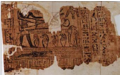
A FACSIMILE FROM THE BOOK OF ABRAHAM No. 1