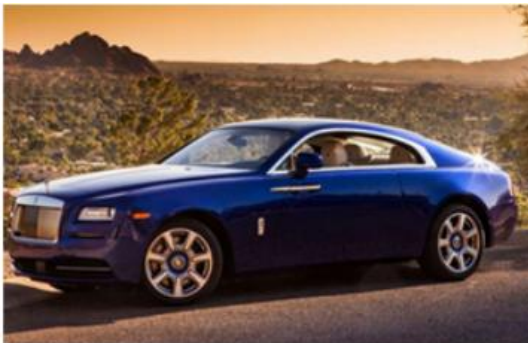
Rolls Royce Wraith 2014 $285,000