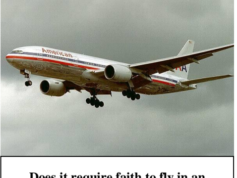
Does it require faith to fly in an airplane?

If Joe Atheist, wanted to leave Cleveland and go to Hawaii, Joe would more then likely choose to go via an airline. Faith, means to put trust in the unseen. Joe will use reason to understand that airplanes fly. Joe will probably connect several points of reason.