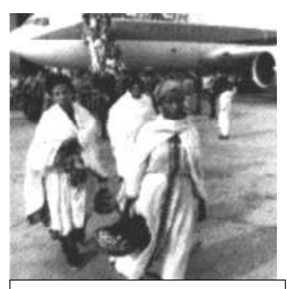
Jews arriving from Ethiopia 1991, foretold in Isaiah 11:11 (2700 years before the event)

The assembling of Israel from the nations after many years was a super-natural revelation that was fulfilled 2500 to 3400 years after Ezekiel and Deuteronomy. There were only two times in Israel's history they were gathered after they were scattered. The first time followed the Babylonian captivity in 537 BC, and the second occurred in the 20<sup>th</sup> century involving the founding of the State of Israel.