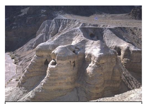
everything. Portions or entire manuscripts of every book of the Hebrew canon were found except for the book of Ester. Many being 1000 years older then existing manuscripts.

Because of the Jewish practice of copying the manuscript and burying or burning the source manuscript that became unusable with age. Very few manuscripts survived earlier then the 10th century AD.