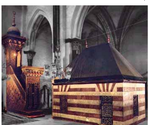
Tomb of the Patriarch Isaac

Dispensational theology views the Church and Israel as two distinct groups. The word dispensation is translated from the Greek word, oikonomia Oikonomia, meaning the management of a household