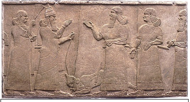
Tiglath-Pileser III, King of Assyria seen here accepting homage from other kings (II Kings 16:7)

To understand the context of these prophecies, we need first to understand what events surrounded Israel at this time. In Isaiah chapter 7, Isaiah delivers message to Ahaz king of Judah.