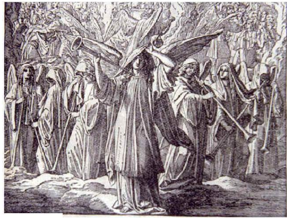
OPENING OF THE SEVENTH SEAL. Rev. viii. 1-5.