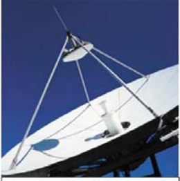
peoples, tribes, tongues, and nations will see their dead bodies three-and-a-half days, Rev. 11:9

27 Then he shall confirm a covenant with many for one week; But in the middle of the week He shall bring an end to sacrifice and offering. And on the wing of abominations shall be one who makes desolate. Even until the consummation, which is determined, Is poured out on the desolate." Daniel 9:27