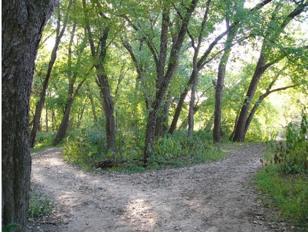
shake off their fruits. Isaiah 33:1-9

1 Woe to you who plunder, though you have not been plundered; And you who deal treacherously, though they have not dealt treacherously with you! When you cease plundering, You will be plundered; When you make an end of dealing treacherously, They will deal treacherously with you.