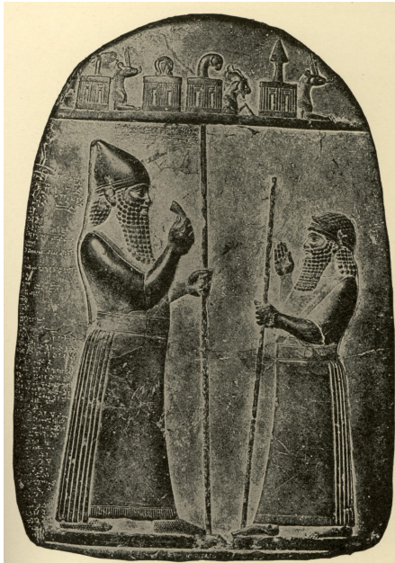
Merodach-Baladan King of Babylon 712 B.C.

15 "What shall I say? He has both spoken to me, And He Himself has done it. I shall walk carefully all my years In the bitterness of my soul. 16 O Lord, by these things men live; And in all these things is the life of my spirit; So You will restore me and make me live. 17 Indeed it was for my own peace That I had great bitterness; But You have lovingly delivered my soul from the pit of corruption, For You have cast all my sins behind Your back. 18 For Sheol cannot thank You, Death cannot praise You; Those who go down to the pit cannot hope for Your truth. 19 The living, the living man, he shall praise You, As I do this day; The father shall make known Your truth to the children. 20 "The Lord was ready to save me; Therefore we will sing my songs with stringed instruments All the days of our life, in the house of the Lord."